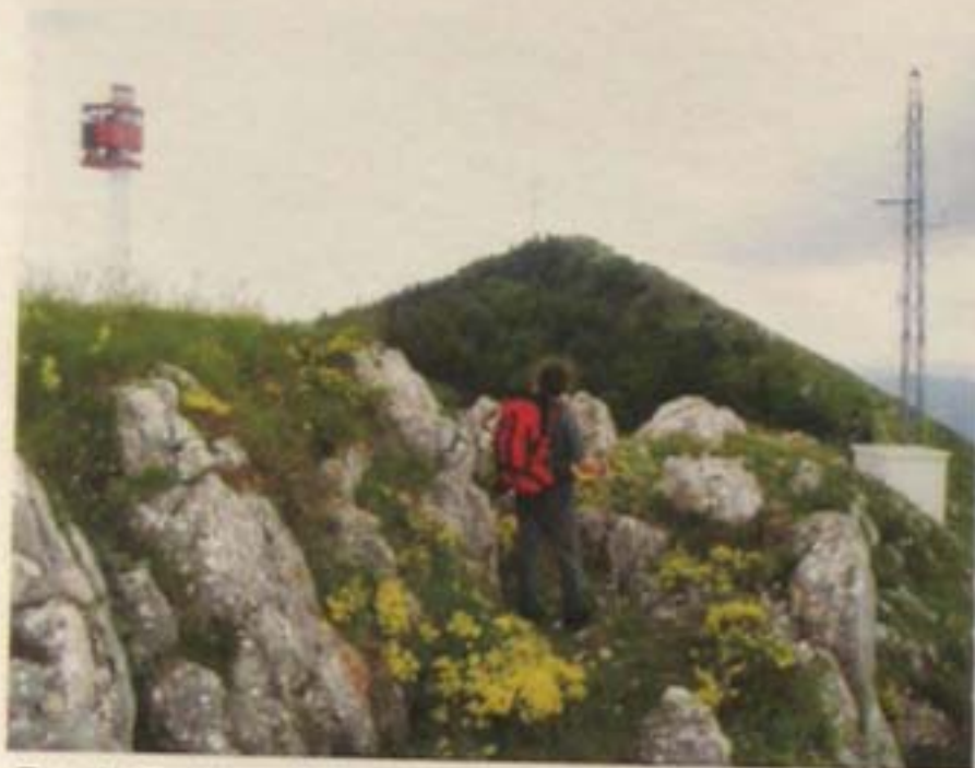
Peak Trebević from western ridge

Starting point: crossing to the top of Trebević at Knjeginjac (1000 m a.s.l.).