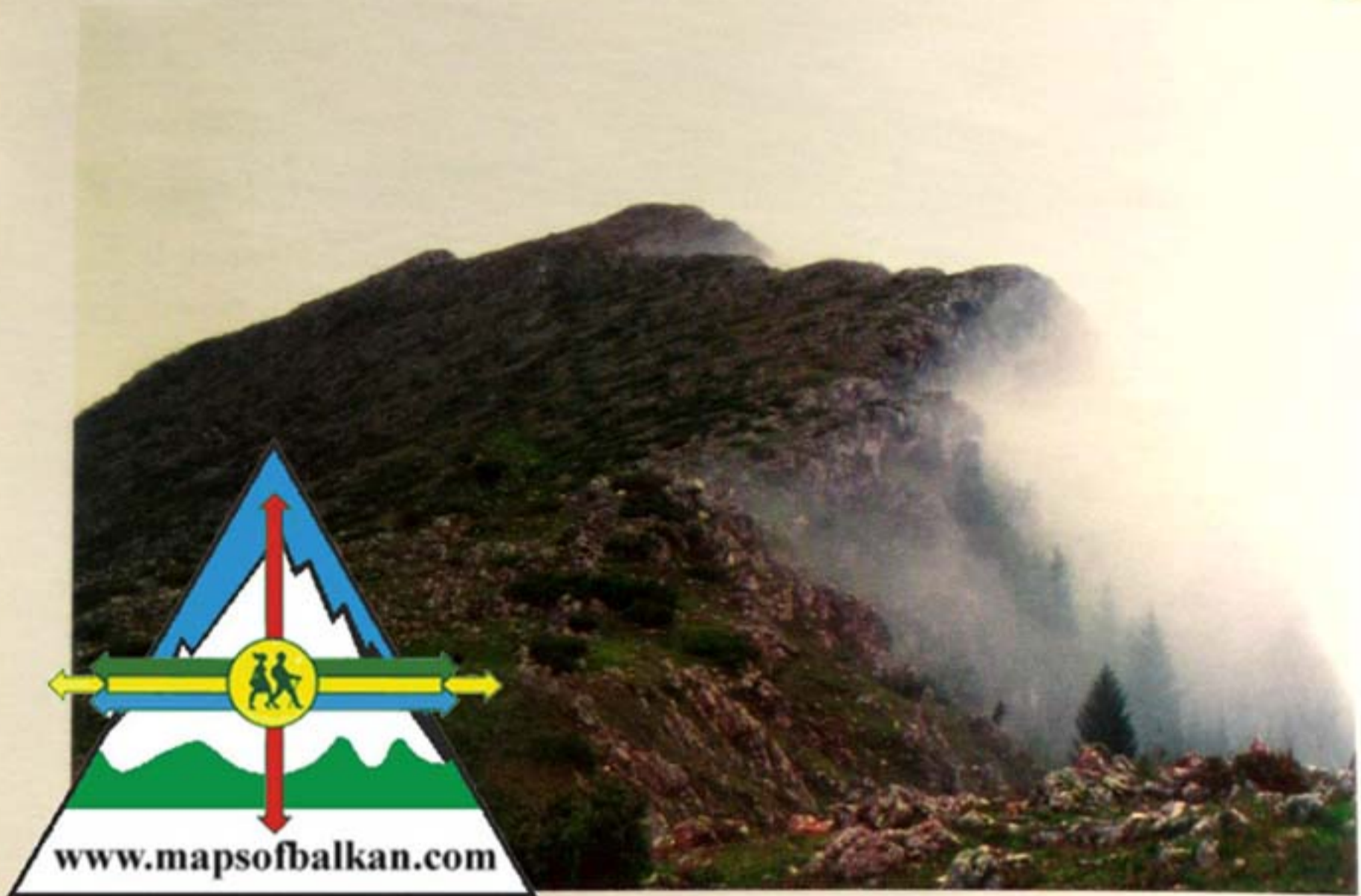
Eastern ridge of Trebević

Starting point: water reservoir Brus at Trebević (1100 m a.s.l.).