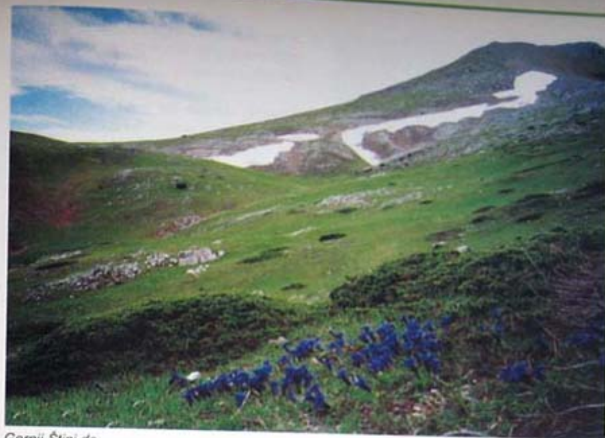
Gornji Štini do

died in the accident, leave the marked path on the right and proceed to non-marked path over Vjetrena vrata. The path is leading to the valley of Mrtvanja and it is well-paved since it is used by owners of weekend houses and shepherds.