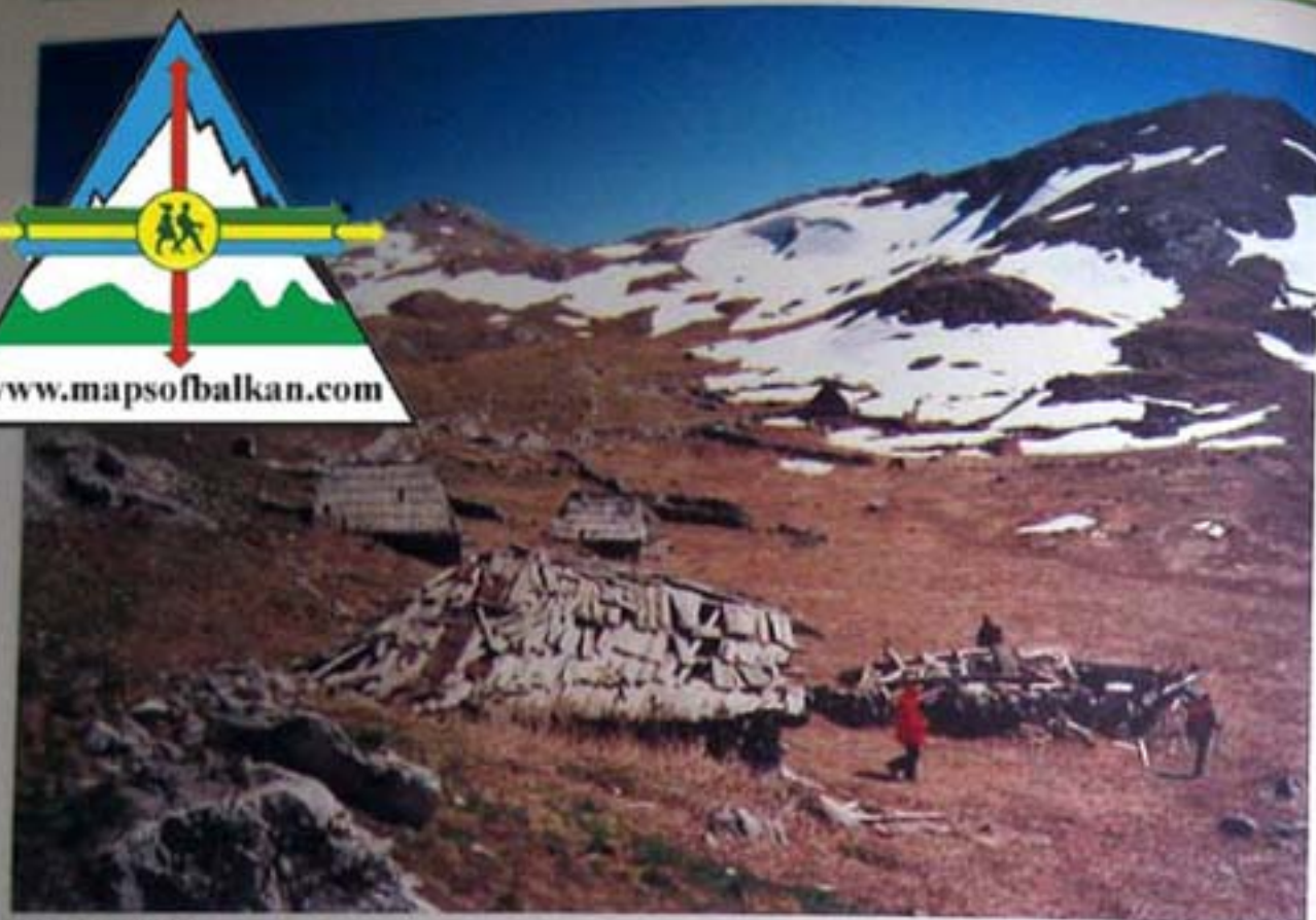
Huts at Krošnja