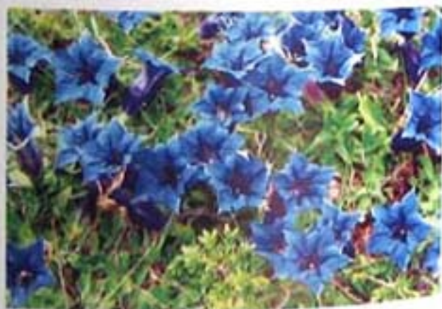
Trumpet gentian - Gentiana kochiana - Perr. & Song.

open depending on agreement with MC Bjelašnica from Sarajevo. From Podgradina follow the path through the forest towards the mountaineering home at Mrtvanjski stanari (1585 m a.s.l.). Having in mind that the tour is very long, the home should be skipped. Before the memorial board for the mountaineer who